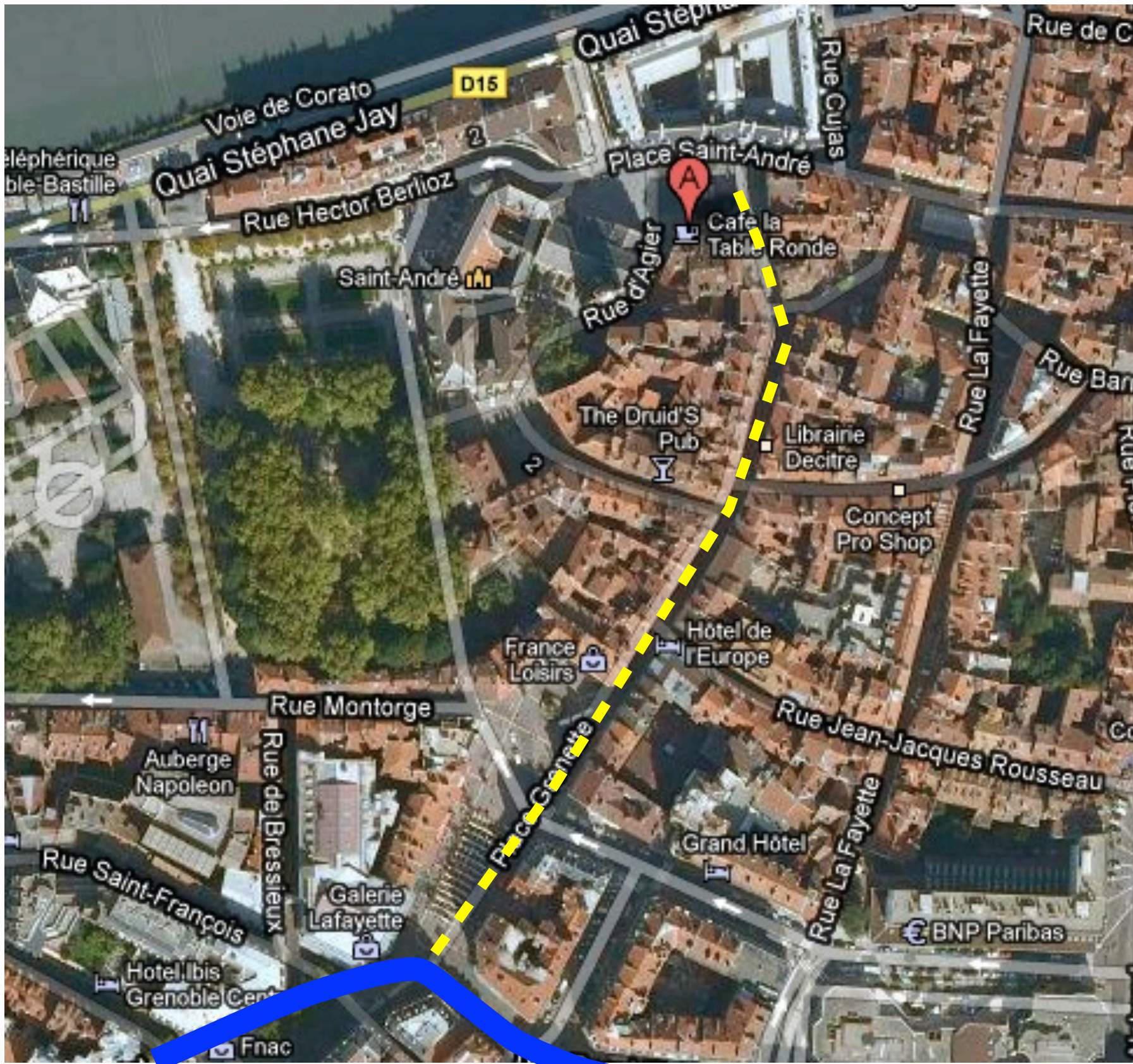
Tram station: Hubert Dubedout